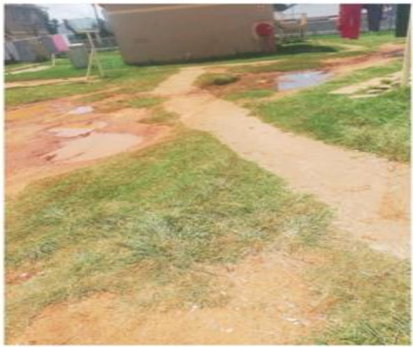
15m x 2m