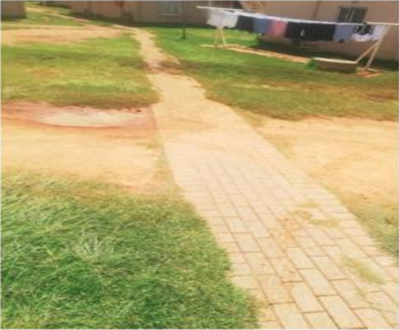
30m x 2m