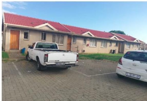
Area = 60m x 30m = 1 800 square meters