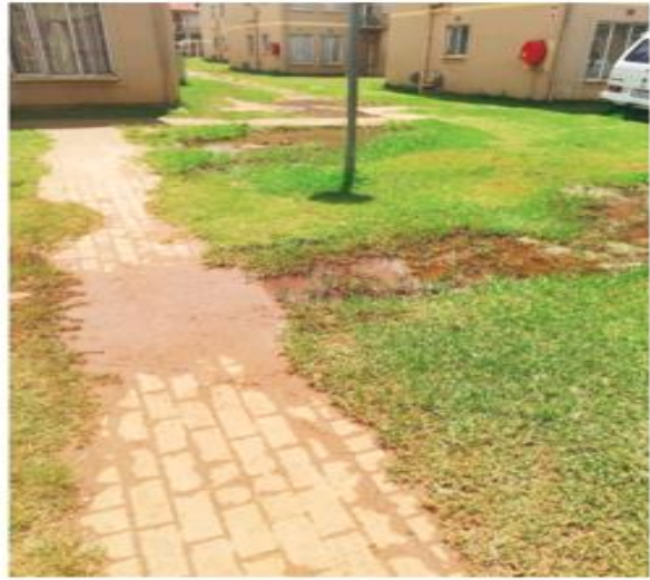
30m x 2m paving 30m x 10m = 300 square meters