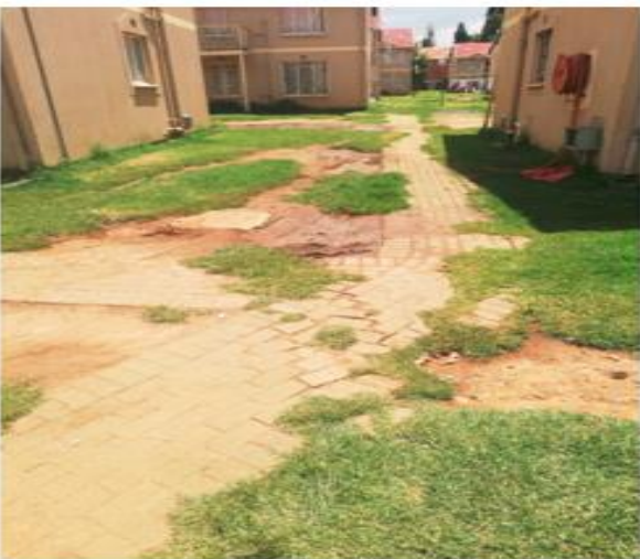
30m x 2m