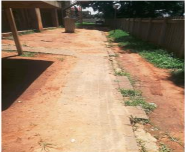
5m x 2m