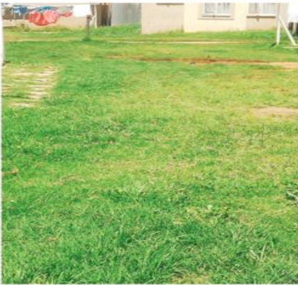
15m x 25m = 375m