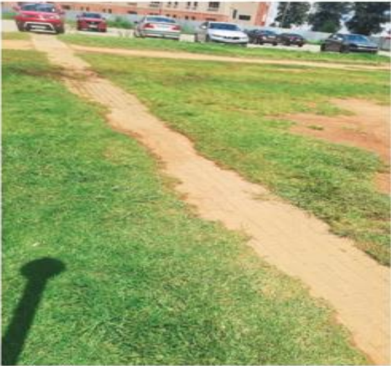
15m x 2m