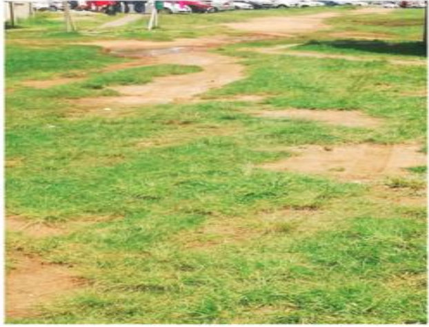
40m x 20m