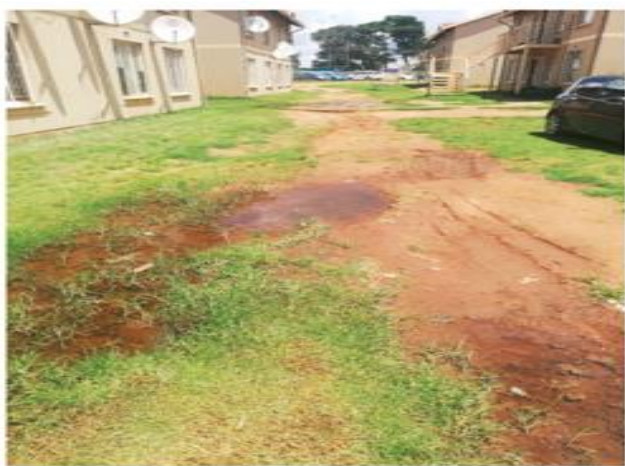
20x30 =600 square meters