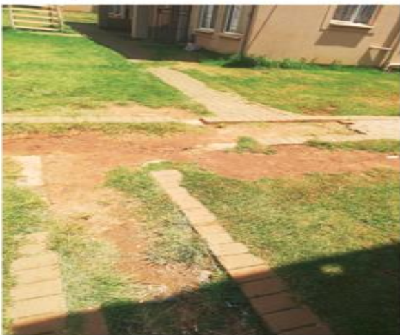
20m x 5m