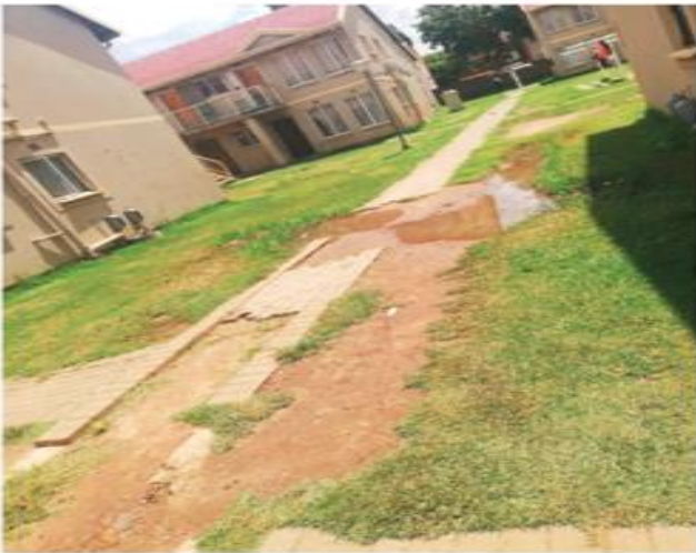
30m x 2m