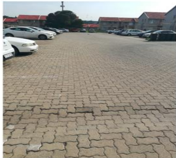
60m × 120m = 720 square meters Delville Ext 3